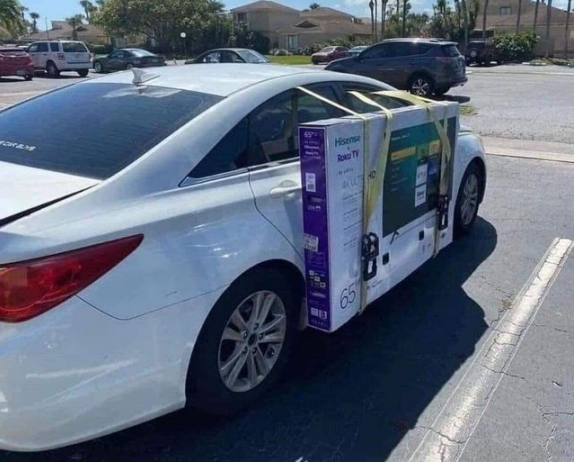
Big Screen Mobile ATV ! - tnx to KV5Y

WOBTV Details: Inputs: 23 cm Primary (CCARC co-ordinated) + 70 cm secondary all digital using European Broadcast TV standard, DVB-T 23cm, 1243 MHz/6 MHz BW (primary), plus 70cm (secondary) on 441 MHz with 2 receivers of 6 & 2 MHz BW Outputs: 70 cm Primary (CCARC co-ordinated), Channel 57 -- 423 MHz/6 MHz BW, DVB-T Also, secondary analog, NTSC, FM-TV output on 5.905 GHz (24/7 microwave beacon). Operational details in AN-51c Technical details in AN-53c. Available at: https://kh6htv.com/application-notes/